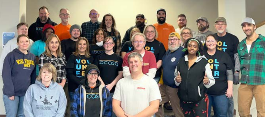
In February, Lacasa staff members spent the day painting at Roosevelt Center with the help of some residents.