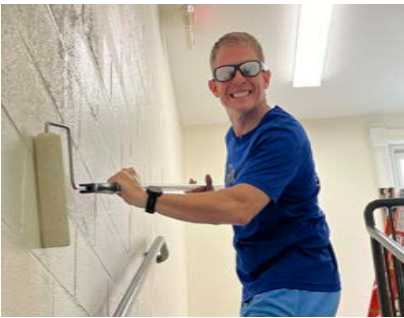
One of the many volunteers from the Goshen Rotary who painted at The Hattle.