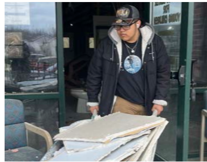
Students from the Goshen Alternative Program cleared demo at Arbor Ridge.