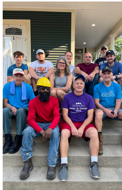
Silverwood Mennonite Church volunteers installed a fence at a State St. property.