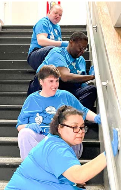
Volunteers from ADEC cleaned and painted the stairwell at Roosevelt Center.