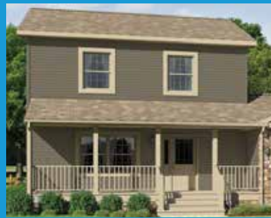
Rendering of proposed modular home.