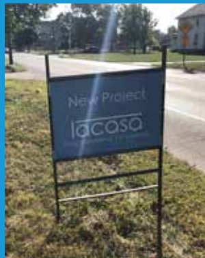
Lacasa New Project Sign