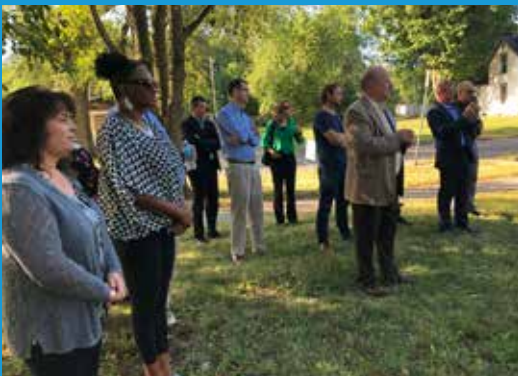
Lacasa staff, partners, & local media at the press event.

Lacasa, Inc. celebrated its newest building project, the Modular Workforce Housing Pilot Program by Indiana Housing & Community Development Authority (IHCDA), with an event on Thursday, September 19. Lacasa will develop 3 single family homes on Blight Eliminated Programs lots in Elkhart. To read the full release, go to www.lacasainc.net/about-us/news/