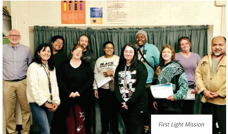
First Light Mission