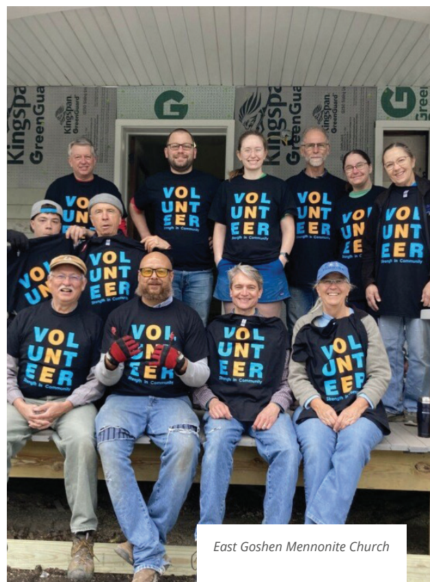
East Goshen Mennonite Church