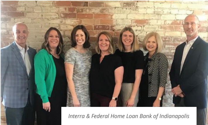
Interra & Federal Home Loan Bank of Indianapolis