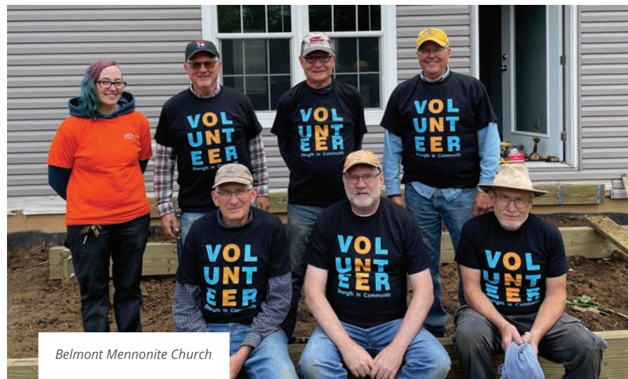
Belmont Mennonite Church