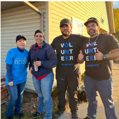
Part of the Wabash crew that worked at The Hattle and Arbor Ridge.