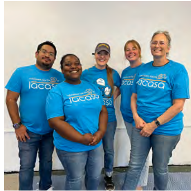
Volunteers from Old National Bank at Roosevelt Center.