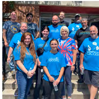
Hoosier Crane volunteers at Roosevelt Center.