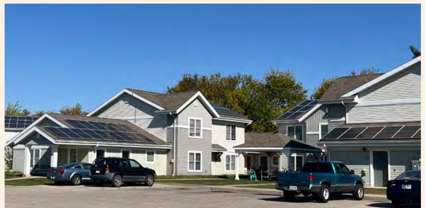
Solar panels installed on Permanent Supportive Housing (PSH) units in Goshen.

Thanks to the Community Development Block Grant and the City of Goshen, we now have solar energy installed on all our permanent supportive housing (PSH) units in Goshen. This shift to renewable energy is crucial for reducing operating costs and promoting environmental sustainability. By lowering utility expenses, we can allocate more resources to resident support, ensuring the long-term affordability of this high-mission program. Additionally, using solar energy helps reduce our carbon footprint, reinforcing our commitment to creating healthier, more sustainable communities for those in need.