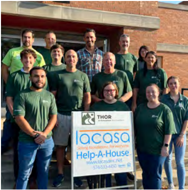
Thor Industries volunteers at Roosevelt Center.