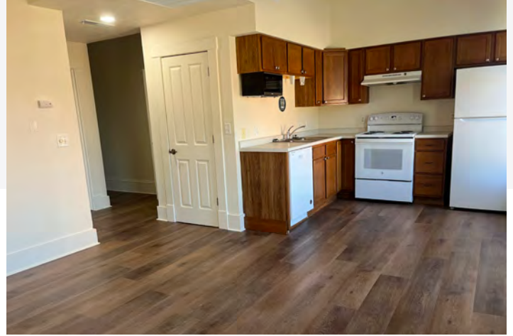
LEFT: The Hattle located at 210 E Lincoln Avenue, Goshen.

Renovations started in early 2024, with a focus on improving energy efficiency and tenant comfort. Upgrades include new HVAC systems, windows, appliances, flooring, and a fresh coat of paint throughout. During the process, tenants were temporarily relocated to completed units while their spaces were being renovated, showcasing a true spirit of cooperation, patience, and community connection. The Shoots building received similar funding, and renovations are scheduled to begin in 2025, ensuring both buildings continue to provide safe, affordable housing for years to come.